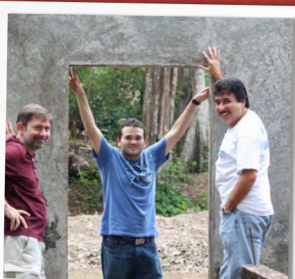
A CHURCH WILL MEET HERE