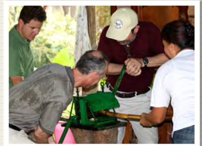
SUGAR CANE JUICE