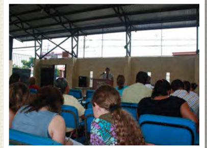
CHURCH IN A GYM